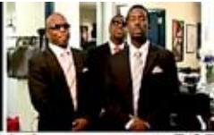
Boyz II Men